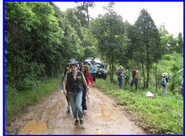
ABOVE: State Alumni and students begin their guided walk led by Thai reforestation experts.

To take action against deforestation and climate change, a dozen Thailand State Alumni joined hands with 15 American Studies Club (ASC) students from Chiang Mai University to implement the “Northern Thailand State Alumni’s Forest Restoration Project” at Mae Sa Mai Hill Tribe Village, Doi Suthep-Pui National Park, on September 3, 2011. Youth alumni from diverse exchange programs, including USBT, Southeast Asia Youth Leadership, Fulbright, YES and Global UGRAD, together with ASC students, helped a local Hmong community to nurture some young trees, apply organic fertilizer, weed and grade local tree seedlings. Project participants also had a discussion with village leaders about the effects of deforestation, such as drought, landslides, and wildlife extirpation. In the past