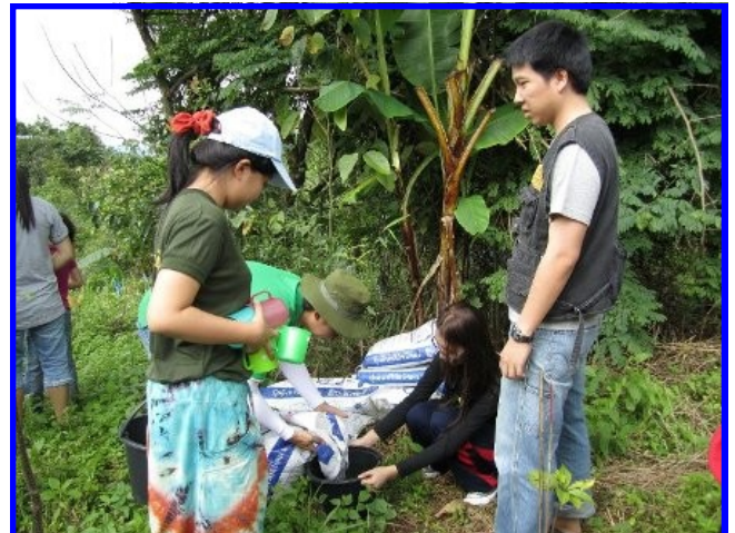
ABOVE: Organic fertilizer ensures that seedlings will have a good chance to grow and thrive.