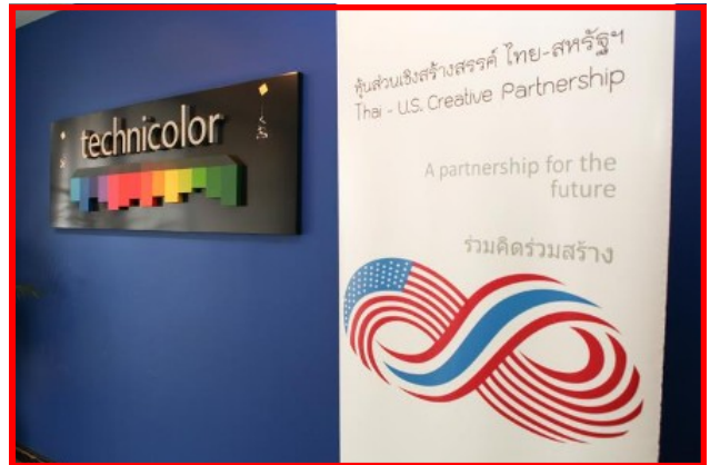
ABOVE: Technicolor and the Thai-U.S. Creative Partnership teamed up to provide Bangkok University students a master film class.