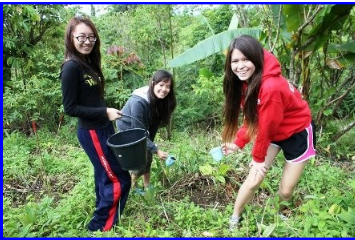
ABOVE: Digging and planting is hard work, but also quite fun when it is done for a good cause!